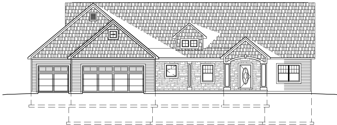
FRONT ELEVATION A-1